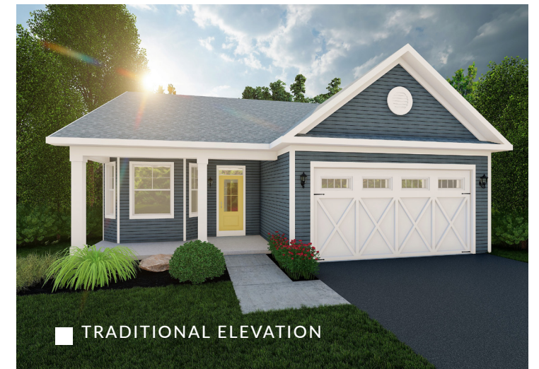
■ TRADITIONAL ELEVATION