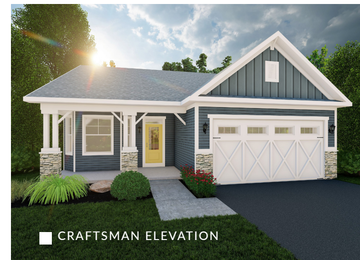
■ CRAFTSMAN ELEVATION