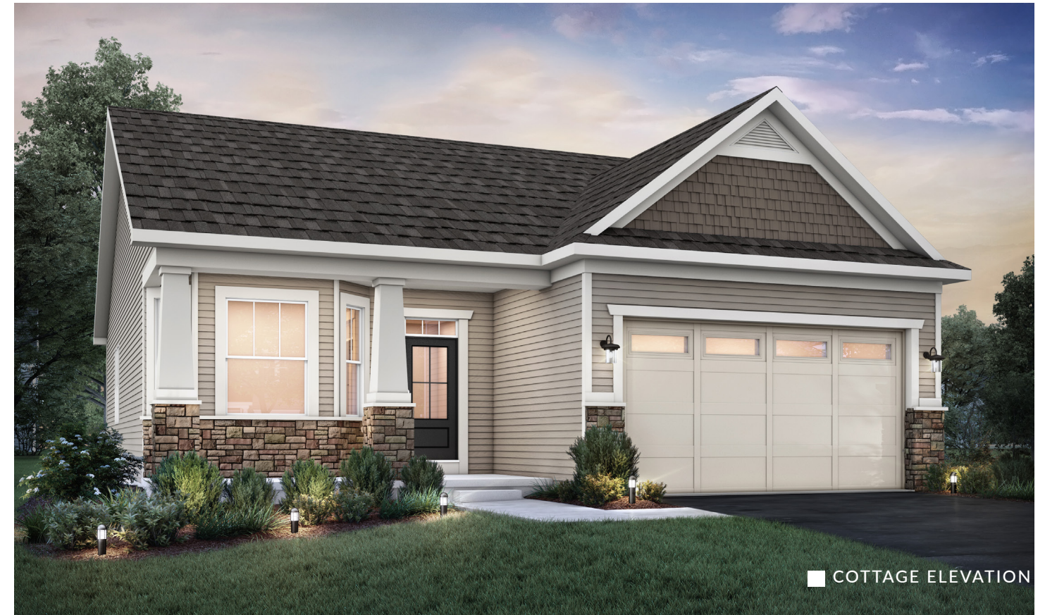
■ COTTAGE ELEVATION

All dimensions and features are approximate and are subject to field variation and/or change without notice. If any discrepancy arises between these plans and the architect's plans, the architect's plans shall prevail.